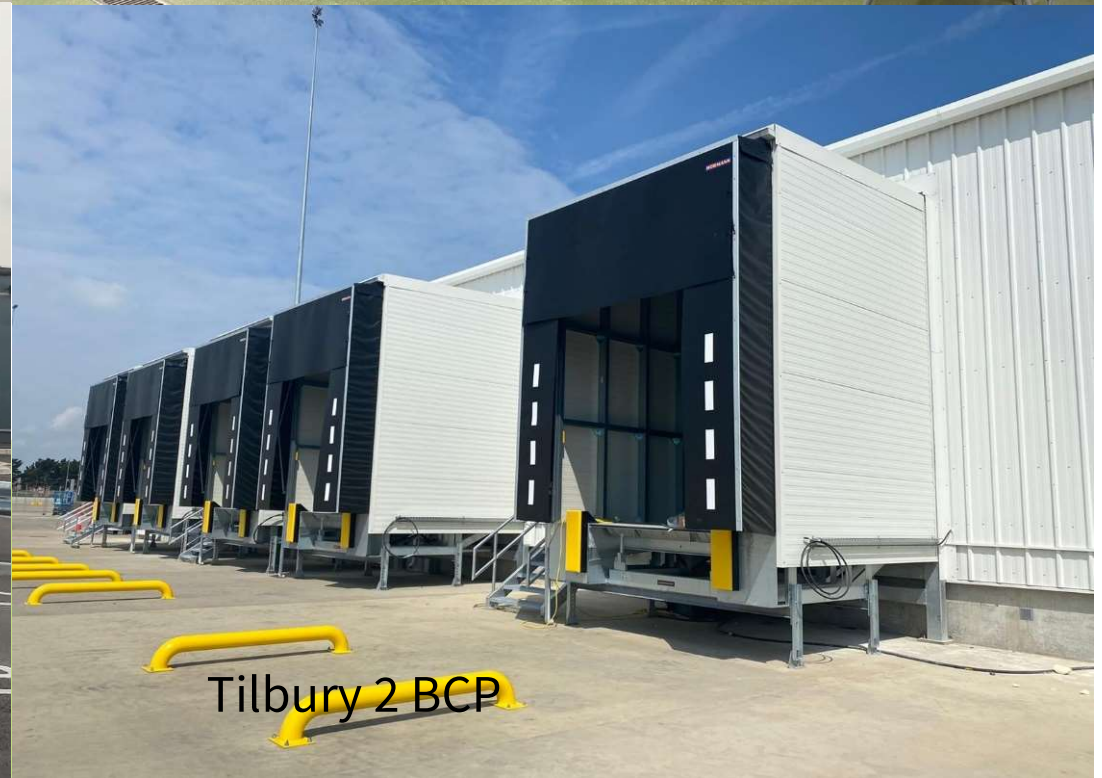
Tilbury 2 BCP